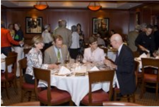
Fleming's Earth Day Dinner

The Bayou Preservation Association was the fortunate recipient of the generosity of Fleming's Prime Steakhouse and Wine Bar in the new CityCentre development in West Houston with a private dinner held on Earth Day, April 22. The invitation to be a part of this evening was generated by public relations firm Studio Communications and Fleming's, which donated the entire cost of the food and wine. All proceeds from the evening, totaling $3900, benefited BPA.