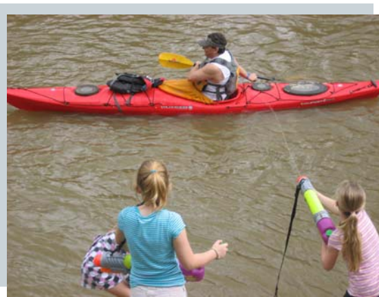
Kids spraying the paddlers