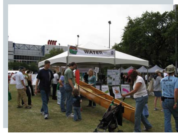
BPA Water Zone at the Earth Day Houston

“The fun run has been going on for a few years, but we wanted to turn this into something on a larger scale. By having BPA and many other environmental groups participate, it was an excellent way to educate the public about who these organizations are, what they do and how they help our eco-system. I appreciate all the volunteers who worked so hard to make this festival such a success. And I know next year will be even bigger and better.” ●